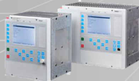
POWER PROTECTION & AUTOMATION PRODUCTS