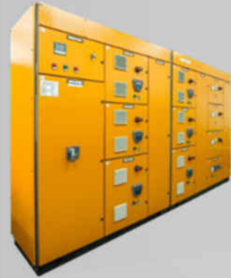
LV & MV PRODUCT SYSTEMS