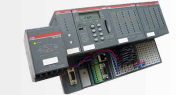
PLC AUTOMATION & CONTROL SYSTEMS