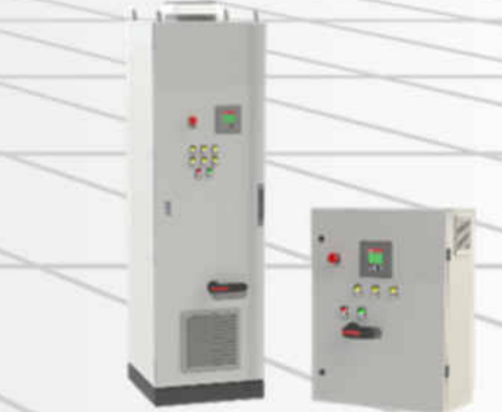
POWER FACTOR CORRECTION