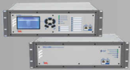
POWER & POWER QUALITY

We offer a comprehensive range of services including product provision, stocking, and manufacturing, all tailored to meet your requirements promptly and efficiently.