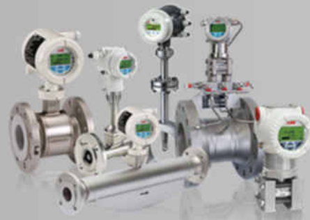
INSTRUMENTATION & ANALYTICS